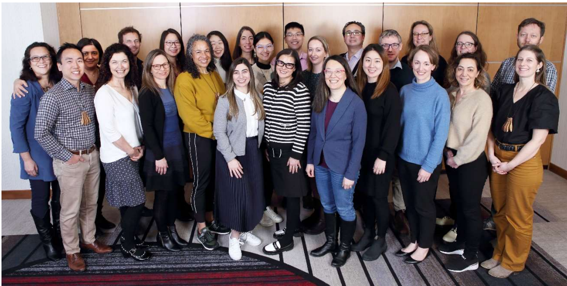
The first cohort of the BEACON Medical Leadership Program

If you haven't heard of this program yet, we are pleased to introduce you to BEACON . PHSA launched a transformative 24-month leadership training initiative in March 2024. This program is designed specifically for medical staff, including Physicians, Dentists, Midwives and Nurse Practitioners, within PHSA. We connected with the PHSA lead at BEACON and medical staff participants half-way through their BEACON experience to find out how it's going.